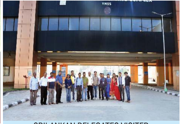
SRILANKAN DELEGATES VISITED SAMA SPORTS COMPLEX