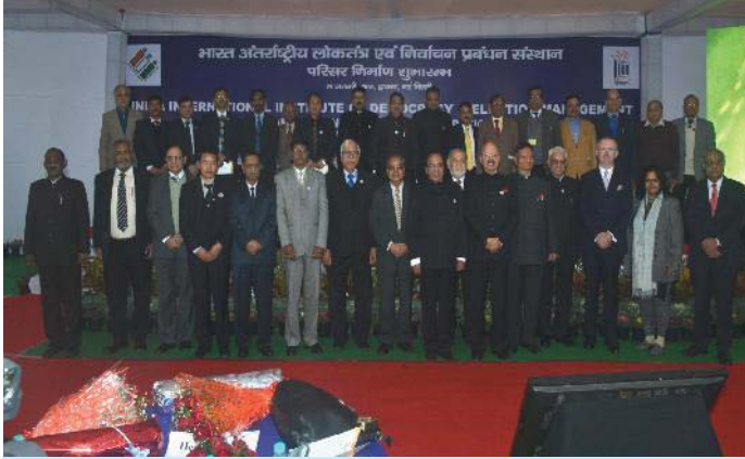
CPWD – IIDEM INAUGURATION