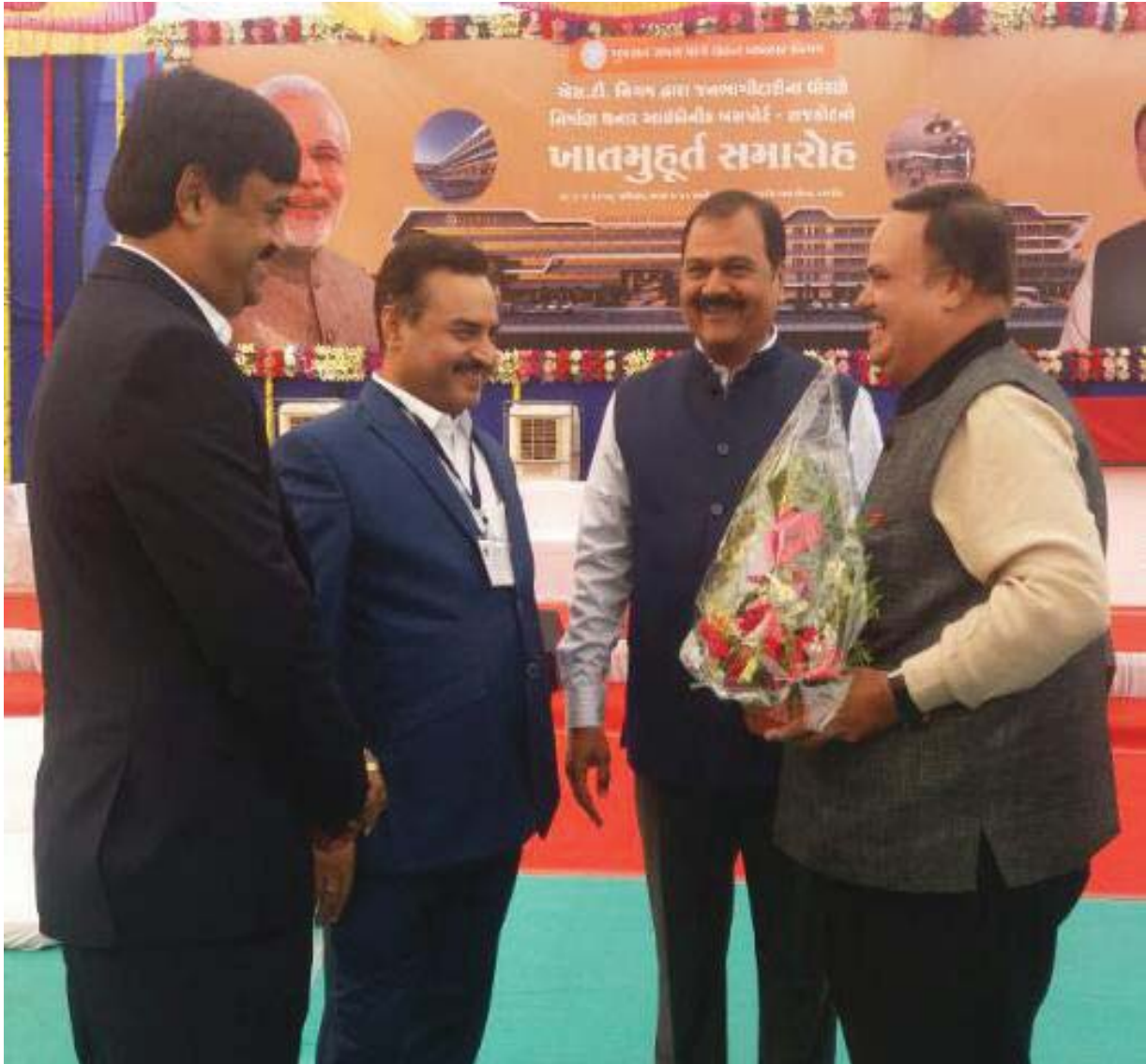
RAJKOT GSRTC BUS TERMINAL INAUGURATION